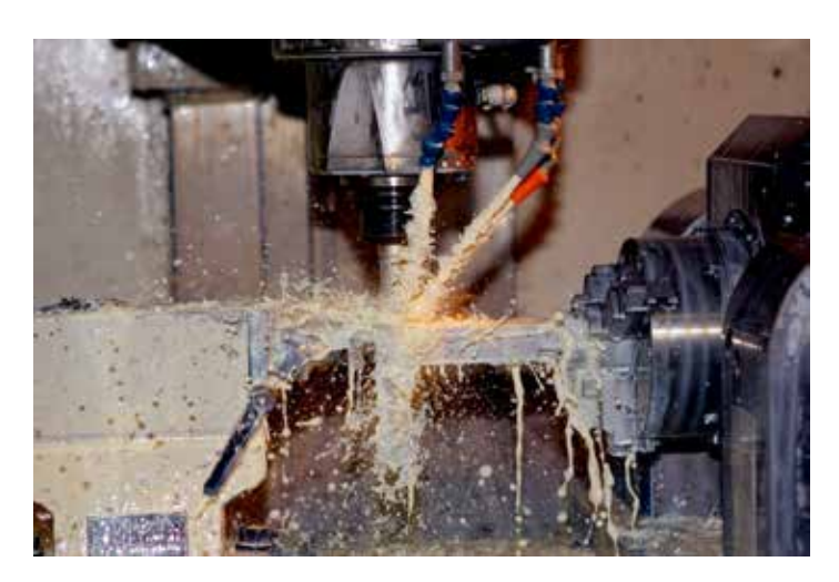
DMS Machining Systems has implemented well over 300 of JMPP's high torquestyle knobs in service for two vital machines, finding that the tool holder tapers and machine spindles last longer and deliver overall better performance and part quality.

Enterprise Welding and Fabricating, Inc. of Mentor, Ohio: Founded in 1975, Enterprise is a family-owned metal fabricator specializing in